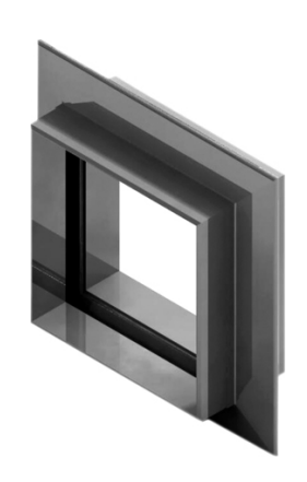
Note | Type MRV - Rectangular Expansion Joint | 3D view